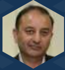
Senator Dr. Musadik Malik Advisor to Prime Minister of Pakistan